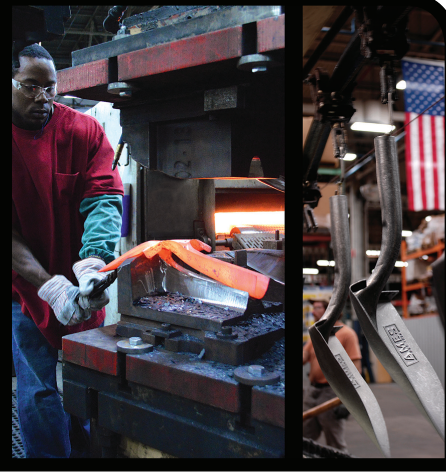
ABOVE: Shovel manufacturing at the Ames plant in Camp Hill.