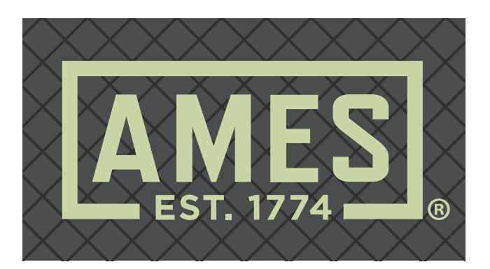
Helping Our Neighbors Get The Job Done, Since 1774